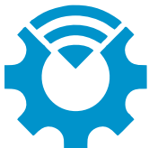
Industrial Internet of Things (IIoT)