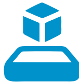
AR/VR Mixed Reality