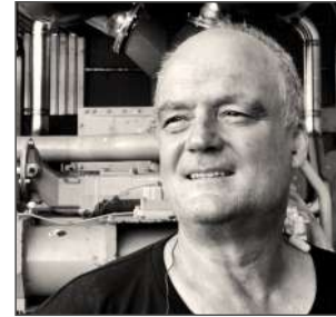
Malcolm strike foundation guarantee ltd