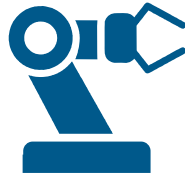
Automation & Robotics