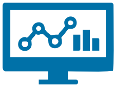
Big Data Analytics